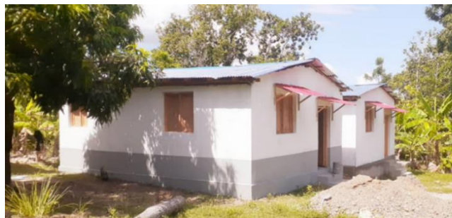
Student Buildings in Haiti