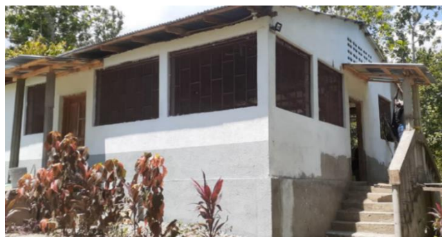
The Multi-purpose Building In Haiti with finishing touches of paint on the exterior. Beautiful!

“However craftily the plots of Satan and his agents may be laid, God can detect them, and bring to nought all their counsels. The response of faith today will be the response made by Nehemiah, ‘Our God shall fight for