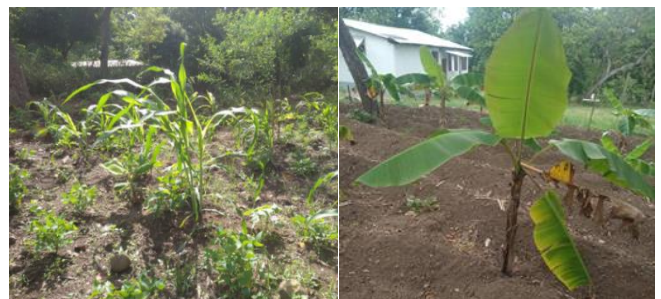
Corn Plants and Banana Trees

The land space, unlike the other Schools, is small, but sufficient to have three additional buildings. Two were designed and outfitted with cupboards and bunk beds for the incoming students, whilst the third was specifically built to secure a generator and solar system. In addition to this, the other existing building, which was used for Sabbath meetings, now has a fully functioning kitchen, an office space, classroom, and visitor accommodation. Surrounding these buildings are many fruit bearing trees, and on the remaining portions of land, they have planted other useful crops such as corn, banana trees, beans, and okra.