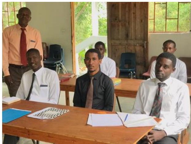
Students and Teachers

Toward the end of January, the School officially began regular sessions with four students and two teachers.