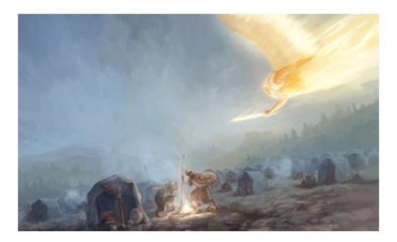
2 Kings 17:1-6; 18:14-37; 19:1-37; 2 Chronicles 32:1-23

The Assyrian Empire had taken over the ten-tribe kingdom of Israel. Now Sennacherib, the king of Assyria, wanted to take over the two-tribe kingdom of Judah. He began taking the cities of Judah one by one. But the city he wanted most was Jerusalem. What Sennacherib did not know was that God was protecting Jerusalem.