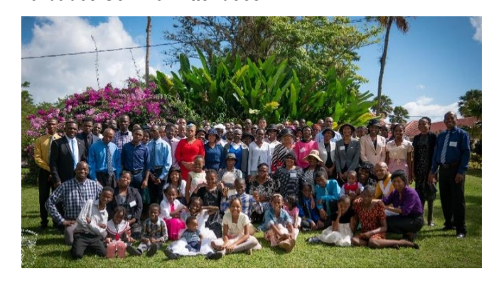
Jamaica Seminar Attendees