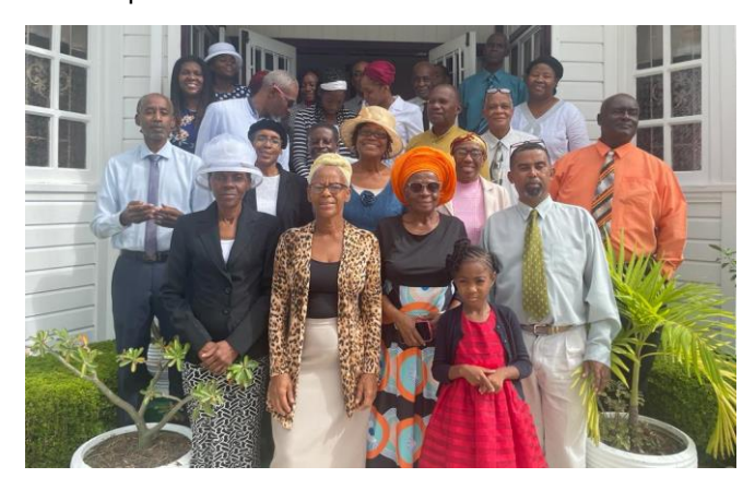
Barbados Seminar Attendees