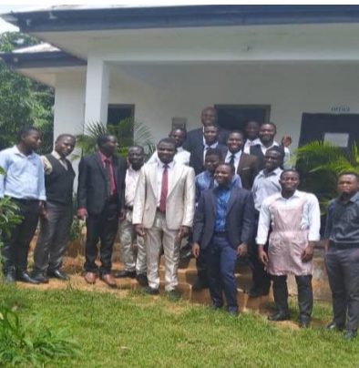
Ghana School of the Prophets: The students and staff joined together to celebrate and send to Bashan brethren the world over a Happy Bashan Day.

We encourage everyone to celebrate Bashan Day and share your day's celebration with us in pictures and letters. Bashan Day is one of our Davidian holidays.