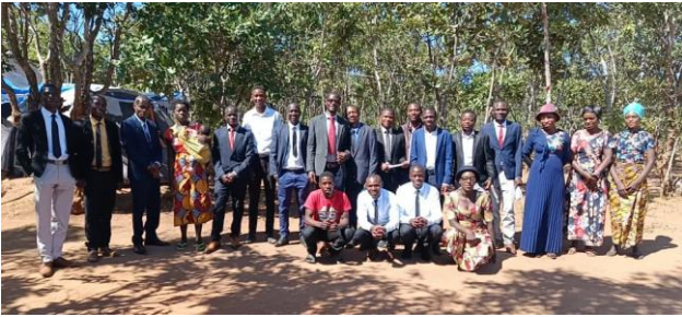
Zambia School of the Prophets: Students and brethren gather together to celebrate.