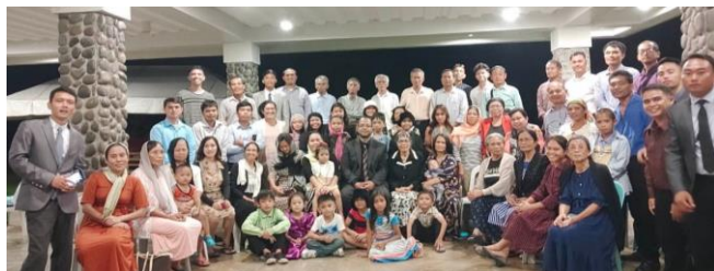
Group picture of the brethren from the island of Mindanao.