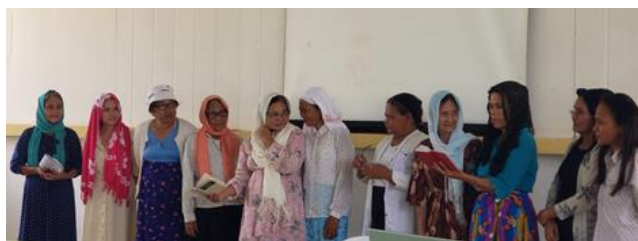
Senior ladies choir at Bohol meeting.