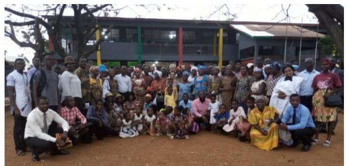
Group photo of the meeting held in Madina.

"The business above all others which should draw and engage the energies of the soul, is the work of saving souls for whom Christ has died. Make this the main, the important work of your life. Make it your special life work. Co-operate with Christ in this grand and noble work, and