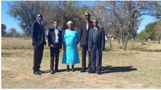
Bashan Center: Bashan workers take time to celebrate in South Africa.