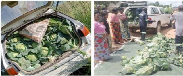
An abundance of Cabbage