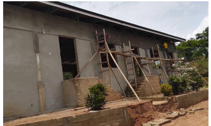
The workmen continue the task of plastering the external wall of the chapel

This School, as with the others, is not only about building up edifices, but that these buildings would afford each student an opportunity to become trained, skilled, self-supporting, self-governing, teachers, and ministers who can work with a pick and shovel in one hand whilst sharing the gospel. They study, plant, repair, construct, garden, cook, mentor, nurture, and manufacture many of the things which are needed right there at the School for its daily functioning and development. The pictures below show some of the continuous daily activities in which the students and staff participate.