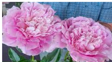
Peonies blossom in May