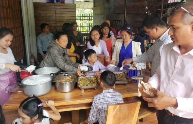
The Luzon Brethren enjoying the fellowship

The beautiful iris, showcased on one wall of the office at Bashan.