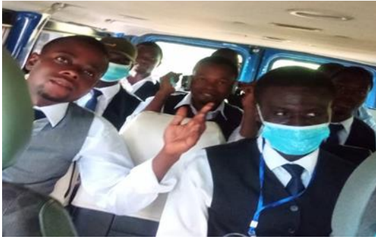
The students on their way to the zoo