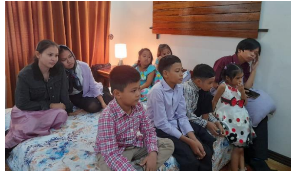
Youth Sabbath School

The meetings held on the 22nd of April in Luzon were well attended. It was a blessed time of studies and fellowship. Meetings were also held in Bohol on the 29th and there will be subsequent meetings in Mindanao on May 6th.