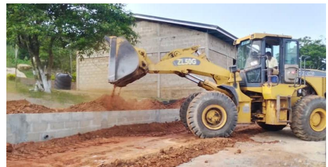
The recent grading of the road which runs through the property

Twice annually the students visit a place they have not seen before. Their most recent outing was to the zoo, located in the capital of Accra.